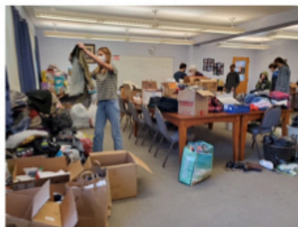
Sorting clothes donated for the refugees